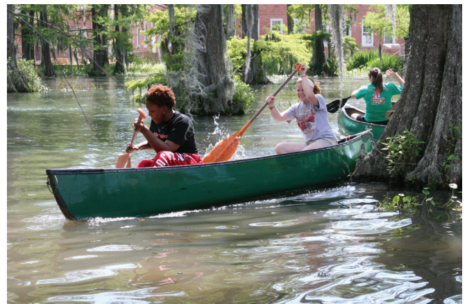
Something extra. That's what Lagniappe Week is all about. Each spring, students take a break from studying with fun activities including canoe races in Cypress Lake.

* You can expect to be finished by 6 PM on Day 2 and by 5 PM on Day 3 of Early Orientation.