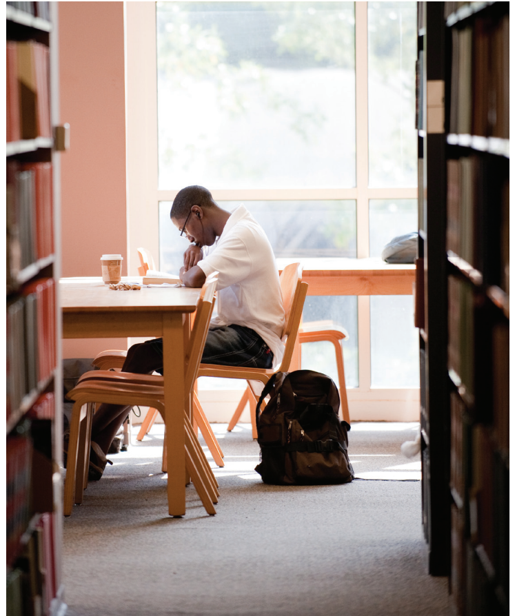
A student takes advantage of the quiet atmosphere in Dupré Library.

orientation.louisiana.edu/resource-center/placement-testing/math-placement-exam